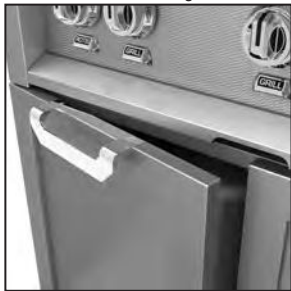
Soft Close Hinges