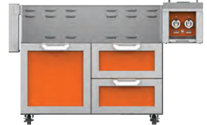
Shown in Optional Color