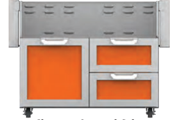
Shown in Optional Color