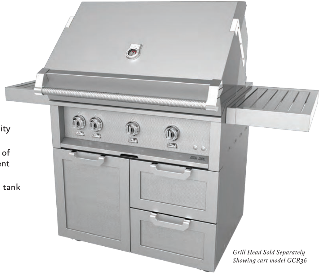
Grill Head Sold Separately Showing cart model GCR36