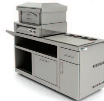
Pizza Prep Cart