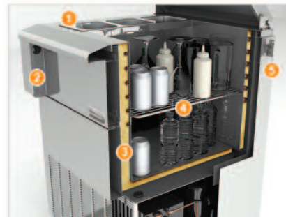
Cutaway view showing frost wall design