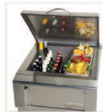
Libation, smoothie juice bar

Incredibly Versatile! Great for use as a bottle cooler, mug froster, martini freezer, fresh fruit smoothie and juice center, deli-prep center, burger topping/condiment bar, salsa bar, bottle/ice bath, wine cooler, Keggerator, and dessert bar!