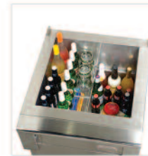
All provision and glass chiller